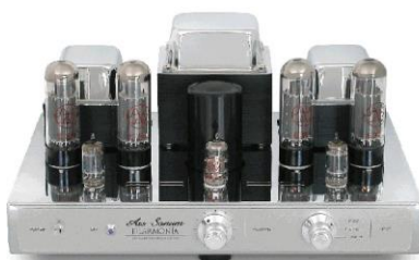
Filarmonia Silver front plate