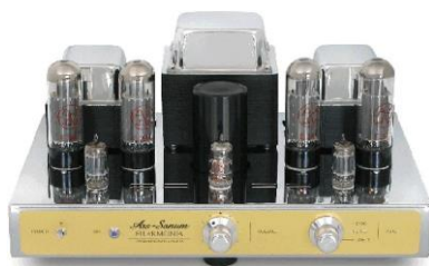
Filarmonia Goldfront plate