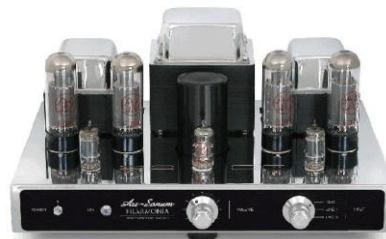
Filarmonia Black front plate