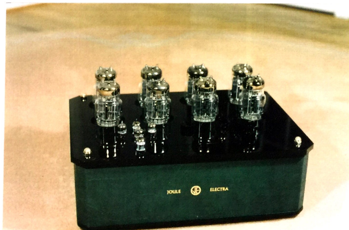
VZN-160 GRAND MARQUIS > OTL MONO BLOCKS