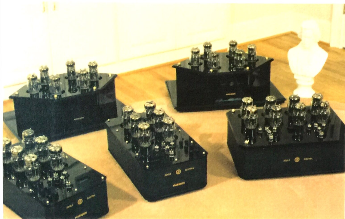
< VZN-100 MARQUIS OTL MONO BLOCKS