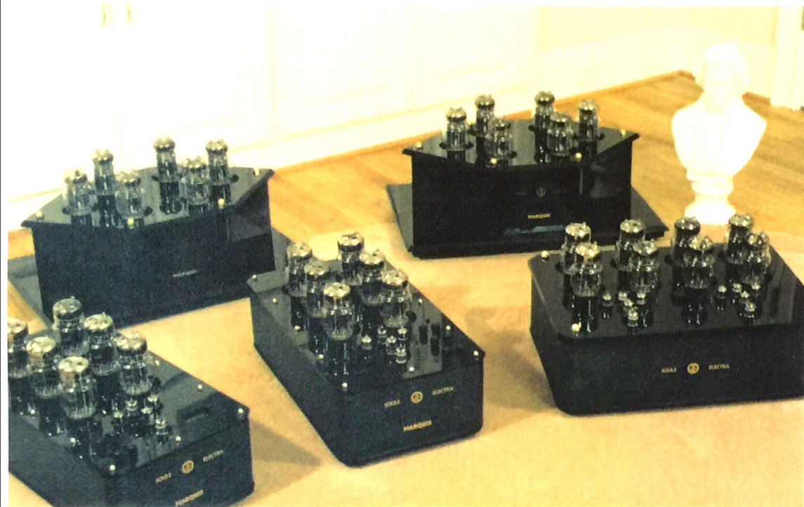
< VZN-100 MARQUIS OTL MONO BLOCKS