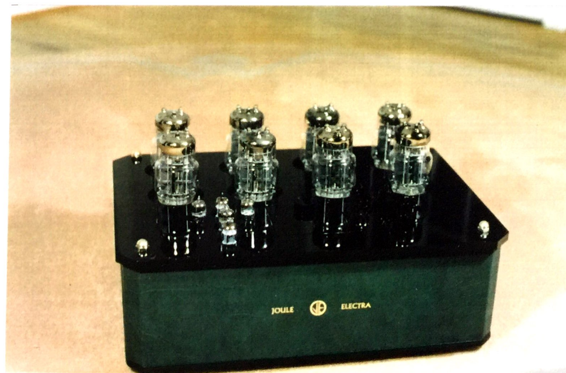
VZN-160 GRAND MARQUIS > OTL MONO BLOCKS